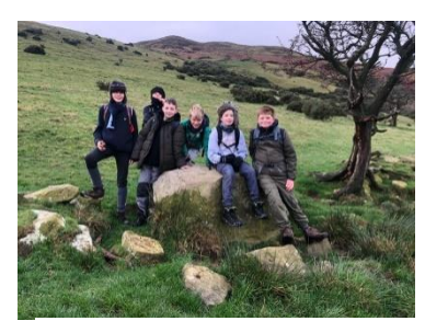
Scout Camp hike