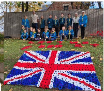
Beavers (6–8 years old) Wed 6pm –7pm