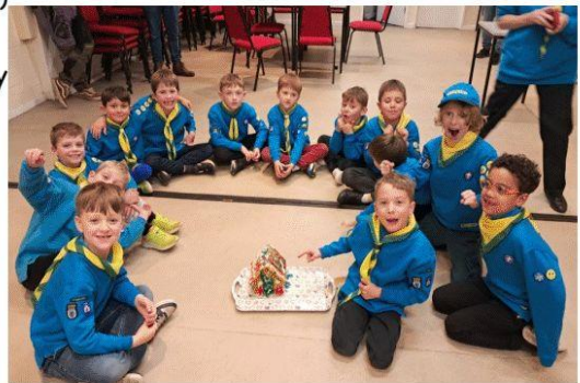
Cubs (8-10½ years old)